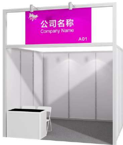
9m 2 (3X3m) 方铝展位